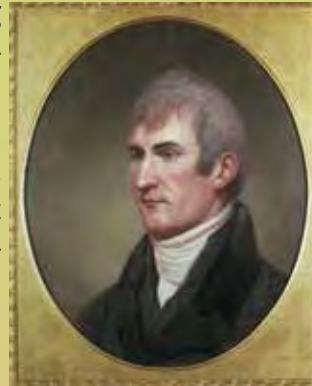
Meriwether Lewis by Charles Willson Peale, from life, 1807.

where travelers crossed the Buffalo River; MP 381.8 Napier Mine ; and an abundance of other stops you're sure to enjoy. One spot that you will not want to miss is the Meriwether Lewis Monument and Gravesite , located at MP 385.9. It is here that Lewis lost his life, which is still one of the greatest mysteries of all time. While en route to Washington DC, during the early morning of October 11, 1809, and while staying in Grinder's Stand , Lewis died of two gunshot wounds. Did he commit suicide or was he murdered? This question is still being debated today. He was buried just yards from the Stand, and in 1848 the State of Tennessee erected a monument consisting of a stone base and a broken shaft, the broken shaft symbolizing a life cut short. Approximately 45